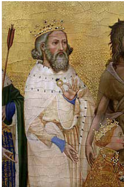
Edward the Confessor from the Wilton Diptych

Although there has been (and continues to be) much debate on Bishop George Bell 's reputation in regard to accusations of abuse, he remains the one Anglican bishop who spoke out bravely during the Second World War. Before the war he had become acquainted with Dietrich Bonhoeffer, the exceptional Lutheran priest (subsequently murdered by the Nazis) and this shaped Bell's understanding of the iniquitous nature of that regime. He had witnessed the coming to power of the Nazis first-hand and strongly supported the Confessing Church (itself anti-Nazi) Bonhoeffer belonged to. During the war, Bell was involved in helping not only displaced persons and refugees who had fled the continent to England, but also the interned Germans and British conscientious objectors, together with a growing awareness that retribution was the wrong approach as the war neared its end. Bell was also a key figure in promoting ecumenism after the war. His life is commemorated on 3 rd October.