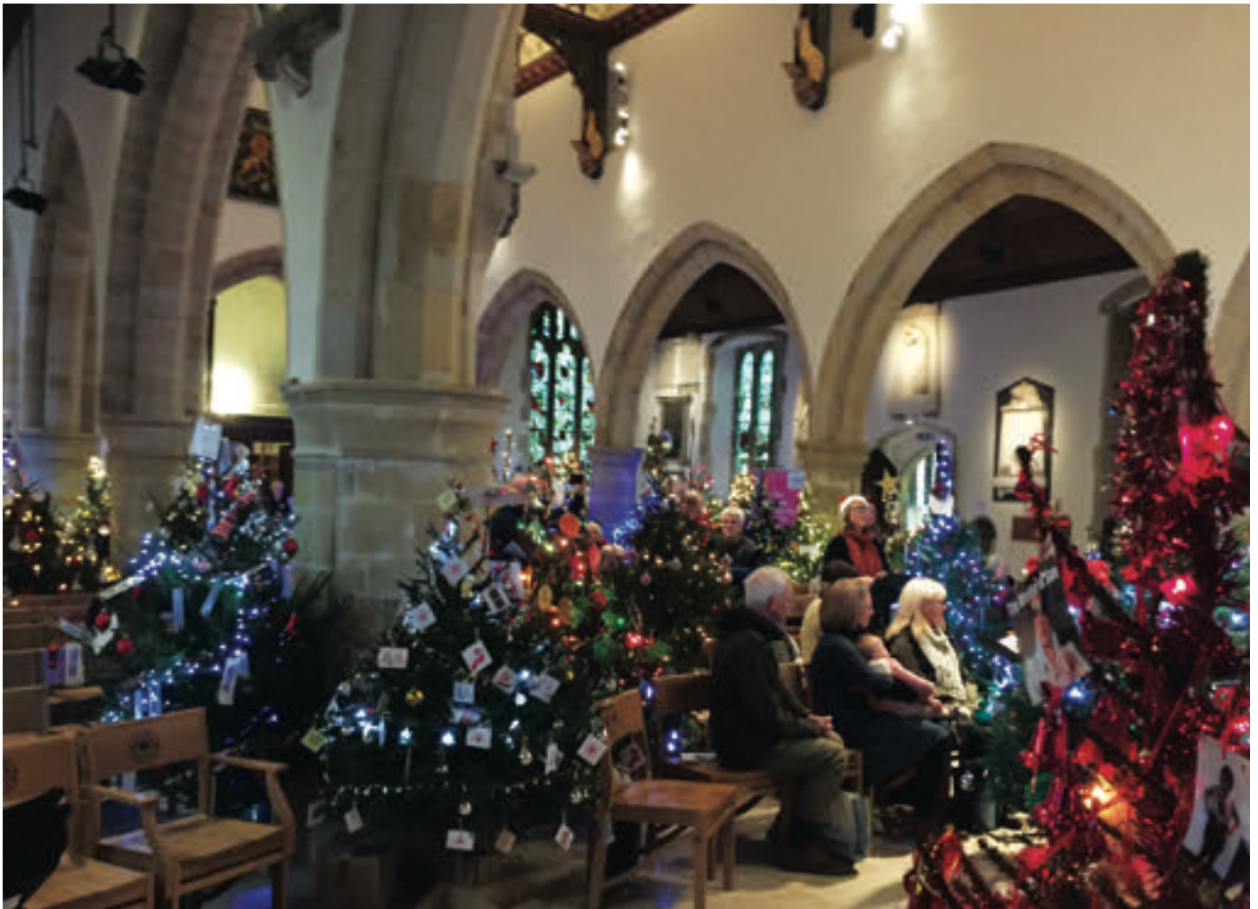
Christmas Tree Festival