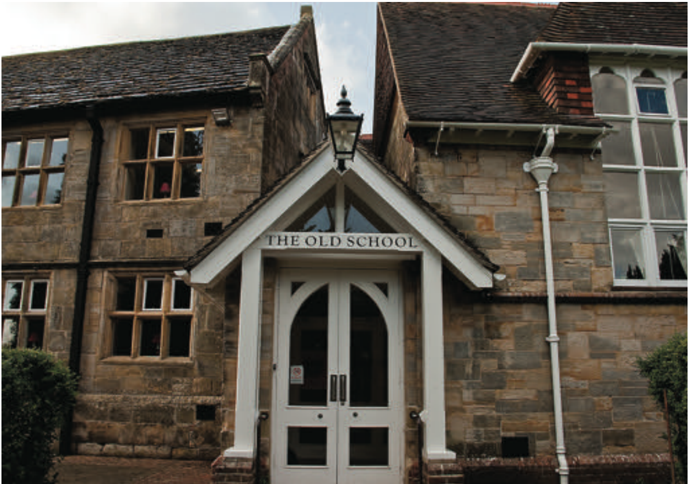
The Old School