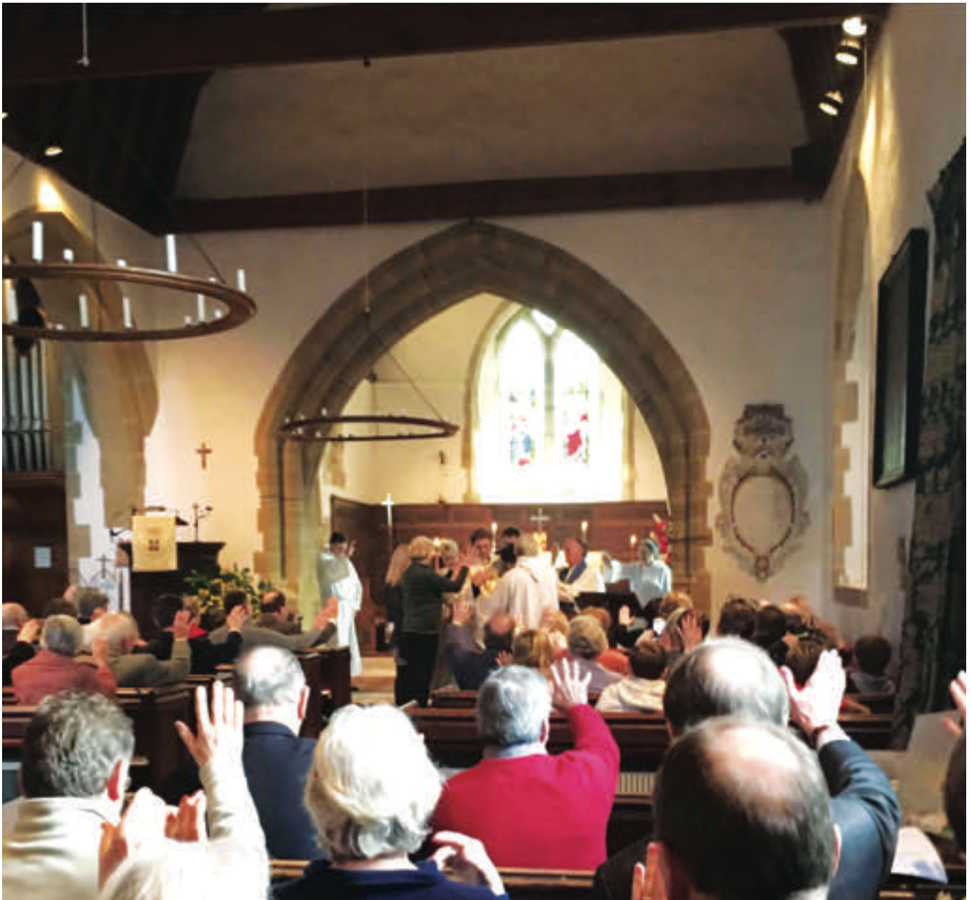
St Mary Magdalene interior