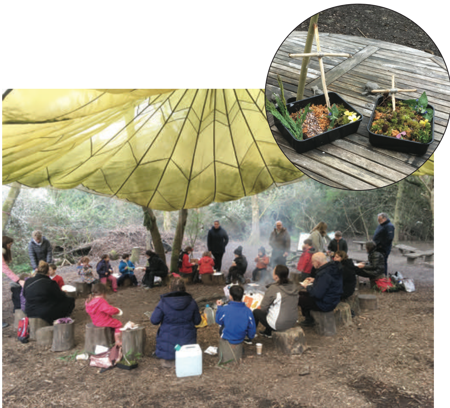
Holy Trinity 'Forest School' making Easter Gardens

grow, compensating Sunday attendance via Zoom declined from 90 in March-April, through 60-70 in May -June, to settle at a continuing 40-50 per Sunday by the end of the year.