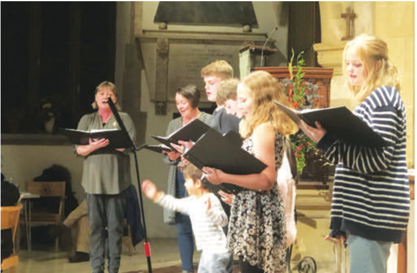
Cuckfield youth leading a service