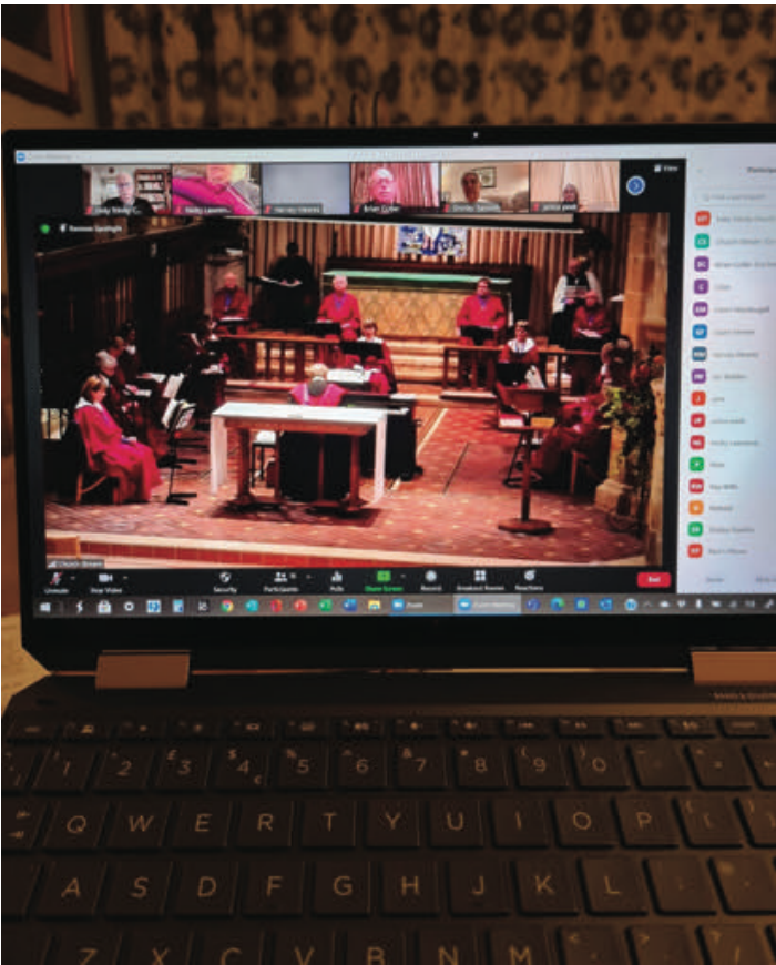
Streaming a service