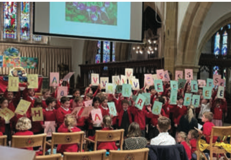
Holy Trinity Primary children in church

other facilities. There are now two classes in each academic year, giving a total capacity for 420 children. The school is set in 6.5 acres of land giving a variety of outdoor opportunities for recreation and education, including an outdoor classroom, the Forest School.