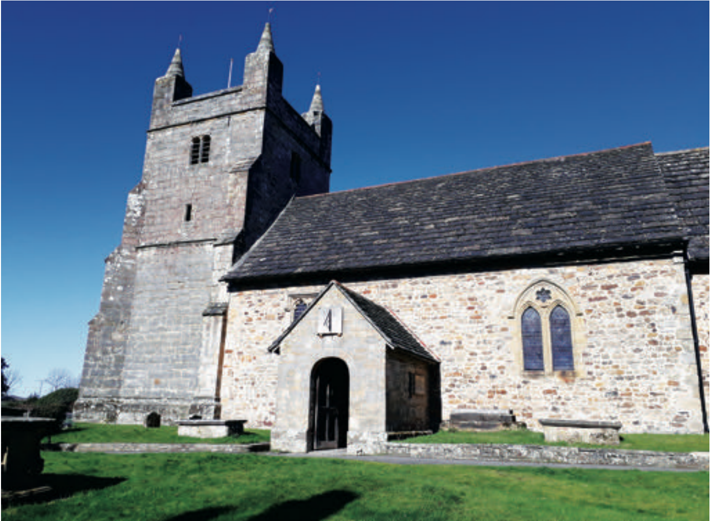
South elevation of St Mary Magdalene, Bolney