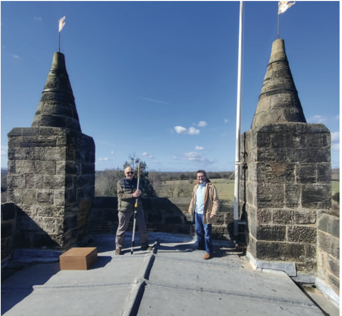
St Mary Magdalene tower pennant