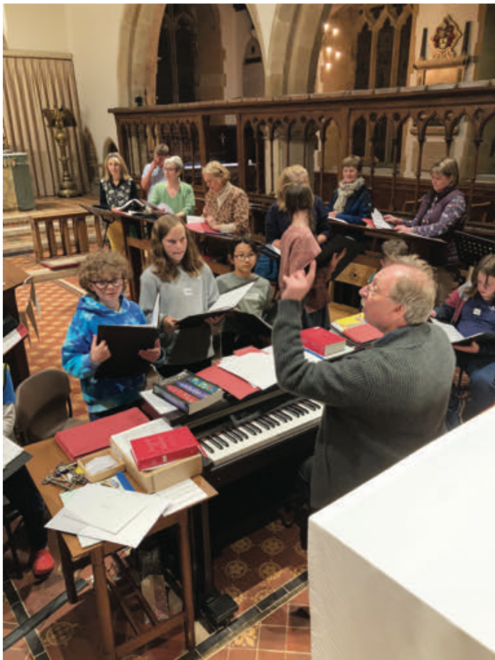
music at Holy Trinity, Cuckfield