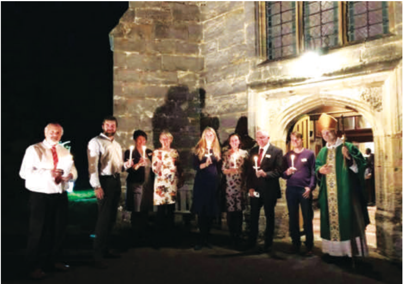
St Mary Magdalene Confirmation group

the children, with many saying that this is their favourite lesson. An act of worship is held each day to which they are pleased to welcome guest speakers.