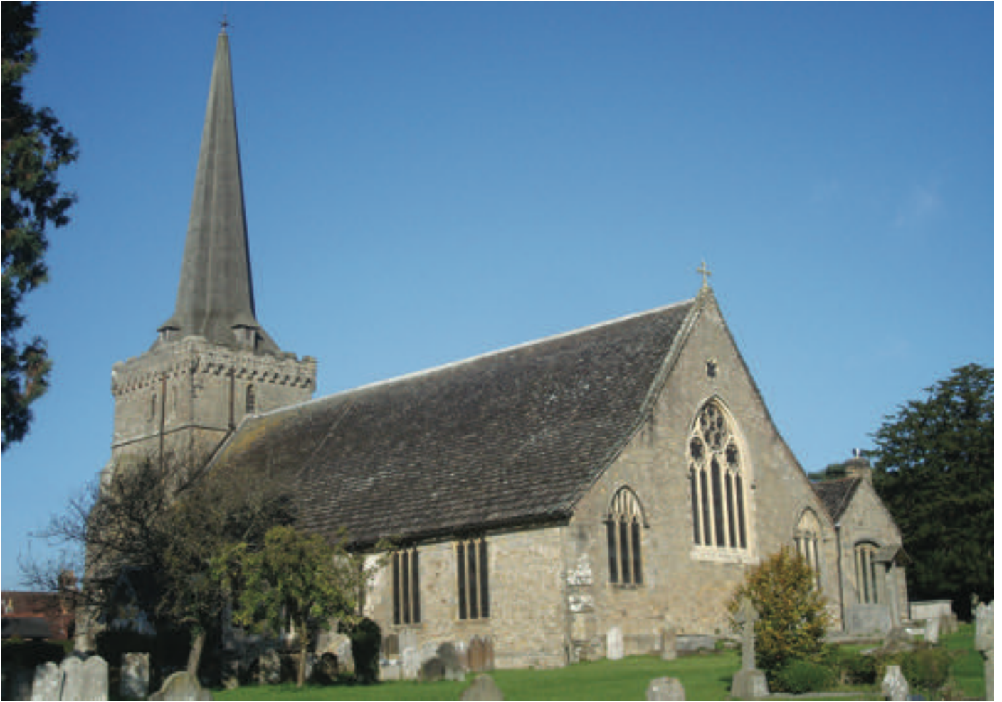
Holy Trinity, Cuckfield