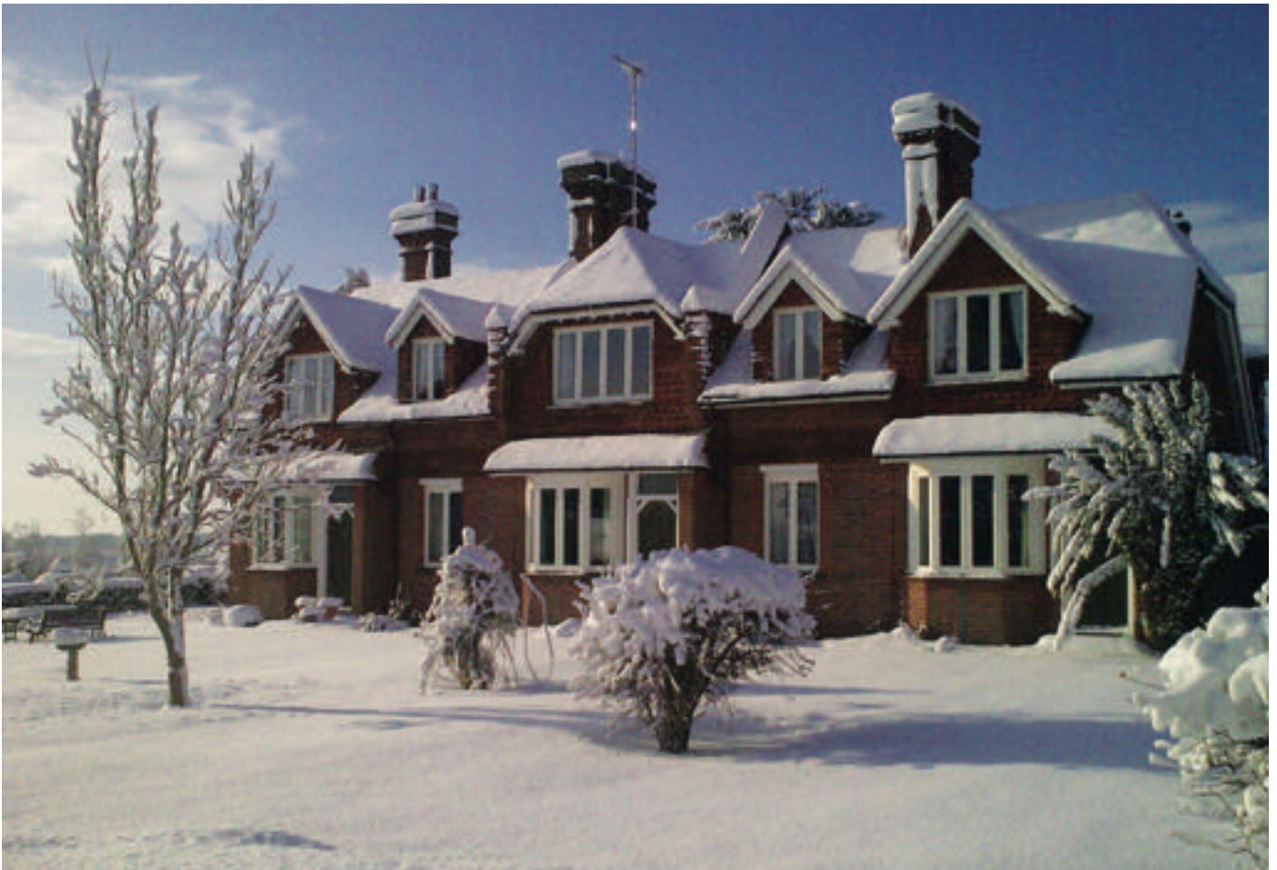
Cottage Homes in the snow

support from the PCC, the trust's income being from residents' maintenance contributions and occasional donations from external funders. The trustees meet about three times a year.