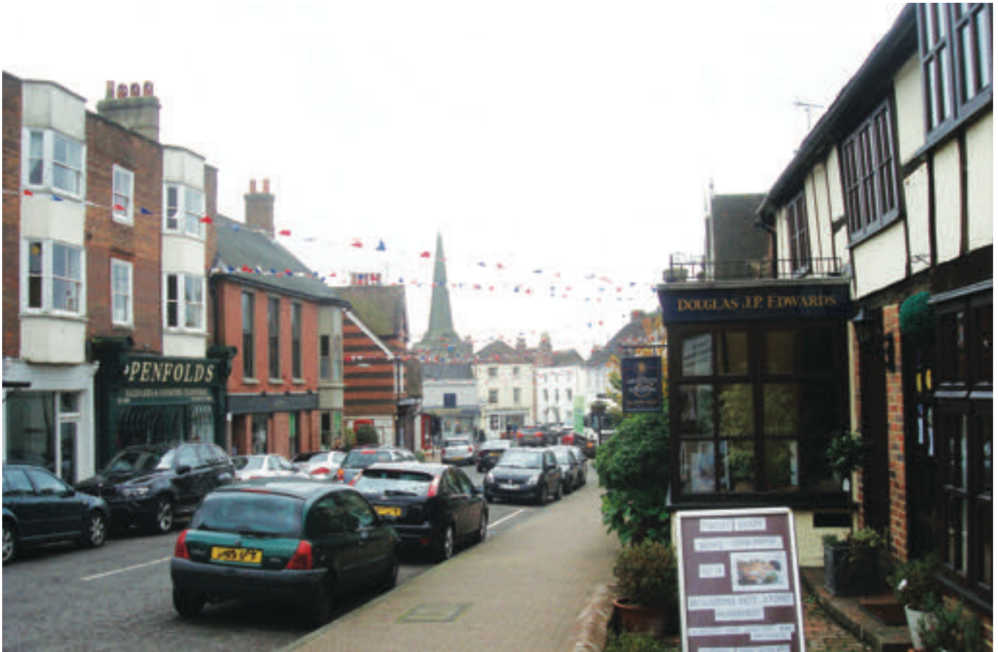
Cuckfield high street with the church steeple in the background

opening three days a week and rapidly growing in popularity.