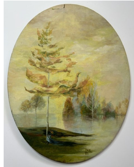
LOT 14 J N B 1985 Asian Water Meadow Oil painting on canvas Unframed elliptical stretcher Frame size: 35x28cm (14x11ins) Starting bid: £30