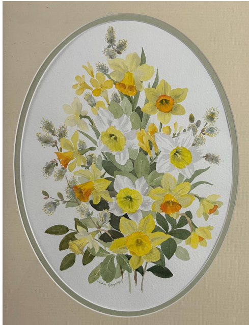
LOT 13 Cuckfield Artist Joan Hadfield Daffodils Original watercolour Double elliptical mounts within a beige and gilt frame Frame size: 49x39cm (19x15ins) Starting bid: £60