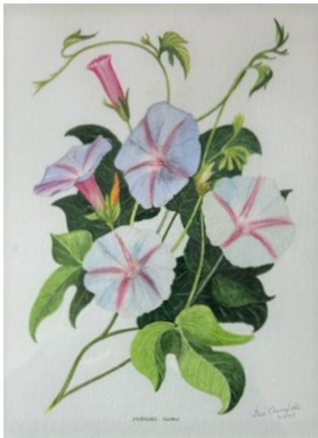
LOT 28 Cuckfield Artist Don Cranefield 2007 Morning Glory Original watercolour Mounted in wood/gilt frame Frame size: 45x37cm (18x14½ins) Starting bid: £50