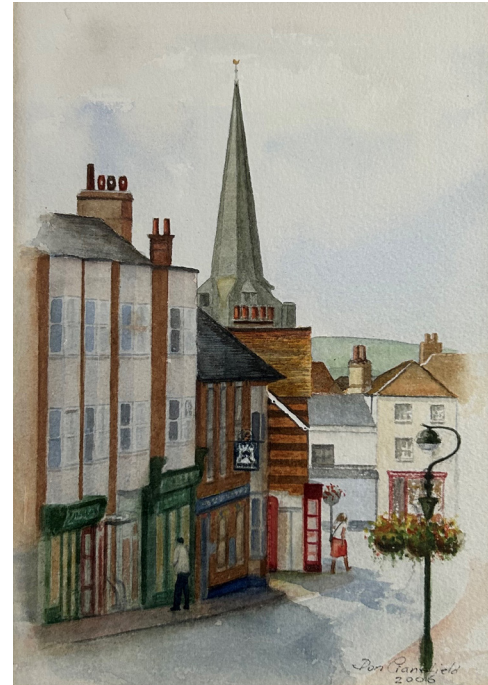
LOT 16 Cuckfield Artist Don Cranefield 2006 The High Street, Cuckfield Watercolour Double elliptical mounts within a Frame size: 31x22cm (12x8½ins) Starting bid: £40