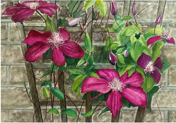
LOT 44 Cuckfield Artist Don Cranefield Purple Clematis Original watercolour Mounted within a green frame Frame size: 46x55cm (18x22½ins) Starting bid £60