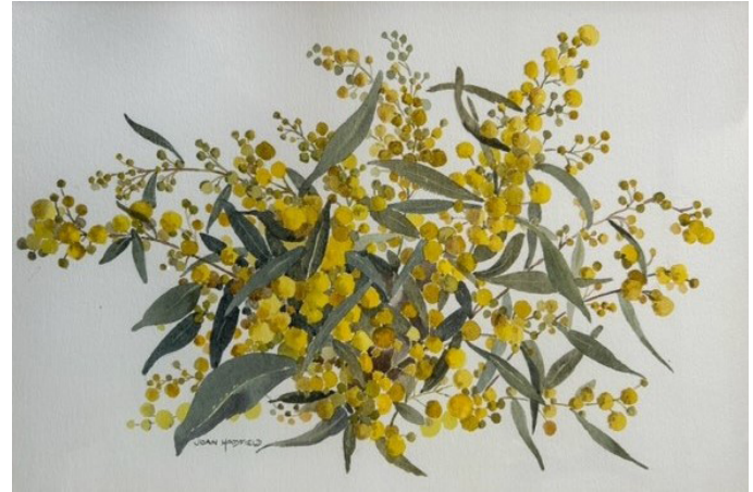
LOT 45 Cuckfield Artist Joan Hadfield Mimosa Original watercolour Double-mounted in a pale green frame Frame size: 41x53cm (16x21ins) Starting bid £60