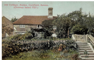
Old Cottage, Anstye, Cuckfield, Sussex. (Chimney dated 1727.)