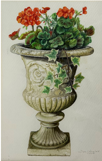
LOT 15 Cuckfield Artist Don Cranefield 2009 Old Etruscan Urn Original watercolour Mounted within a light wood frame Frame size: 58x44cm (23x17ins) Starting bid: £70