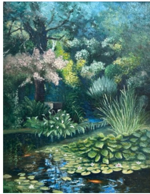
LOT 29 Cuckfield Artist Don Cranefield 1993 Combe Gardens Pool Oil painting on panel Canvas mount in green frame Frame size: 60x49cm (23½x19½ins) Starting bid: £80