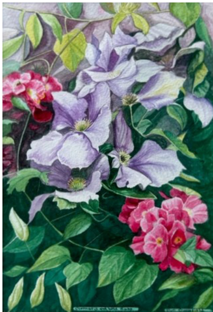
LOT 27 Cuckfield Artist Don Cranefield Clematis and Wild Rose Original watercolour Mounted in wood/gilt frame Frame size: 38x30cm (15x12ins) Starting bid: £40